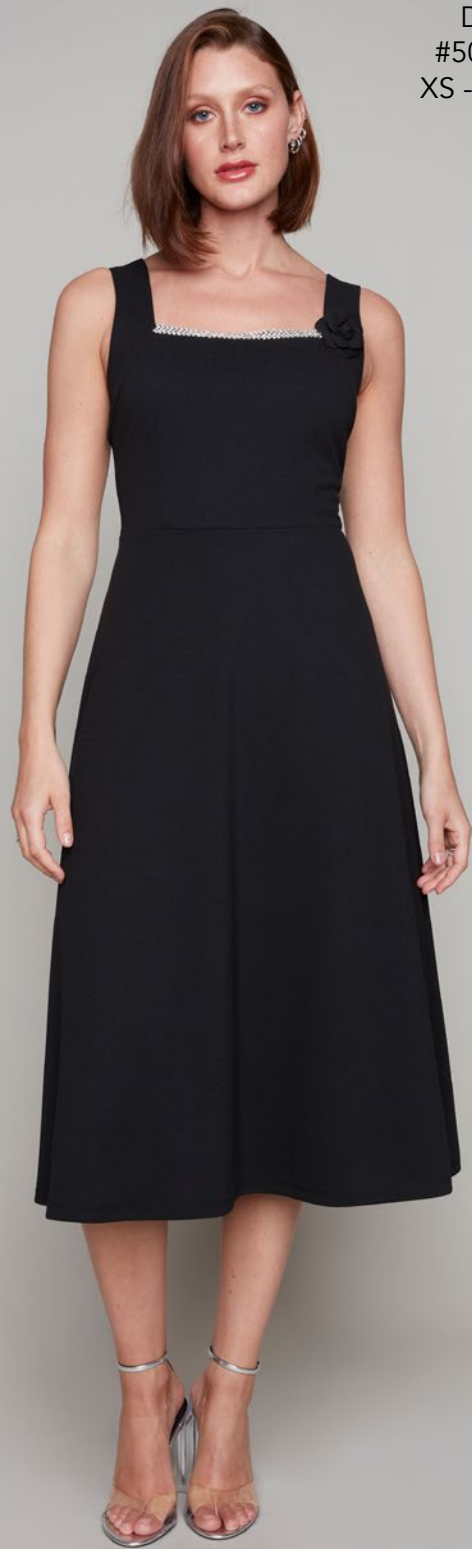
Dress #50102 XS - XXL