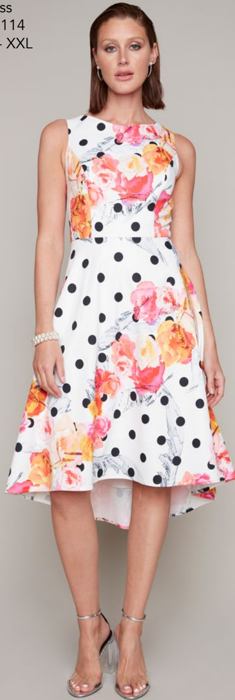
Dress #50114 XS - XXL