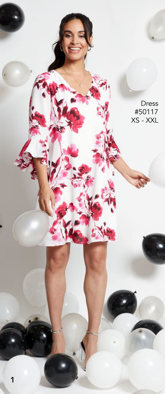
Dress #50117 XS - XXL