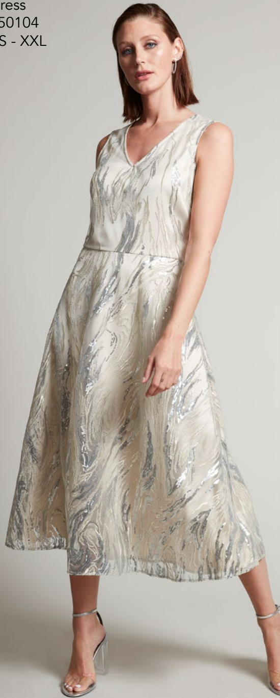
Dress #50104 XS - XXL