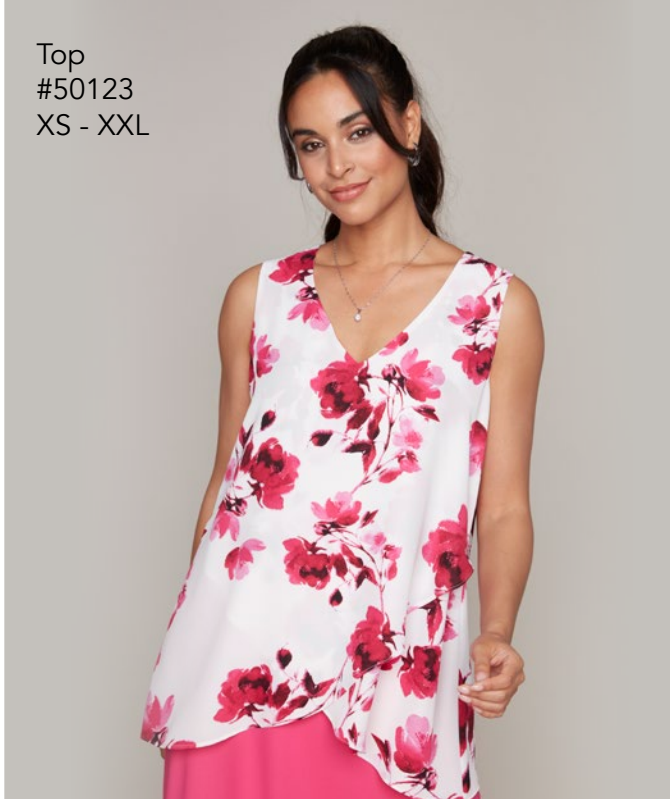
Top #50123 XS - XXL