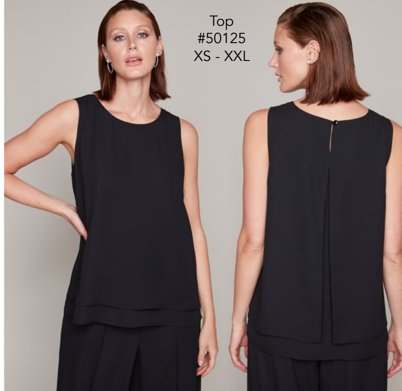
Top #50125 XS - XXL