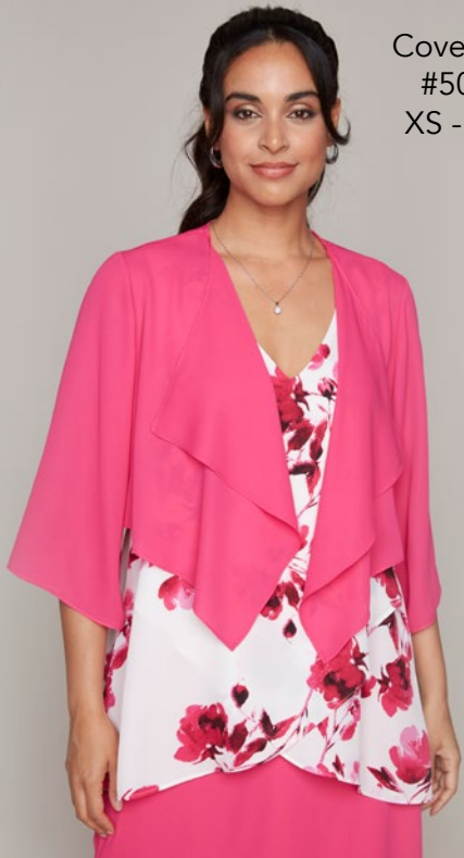
Cover Up #50124 XS - XXL