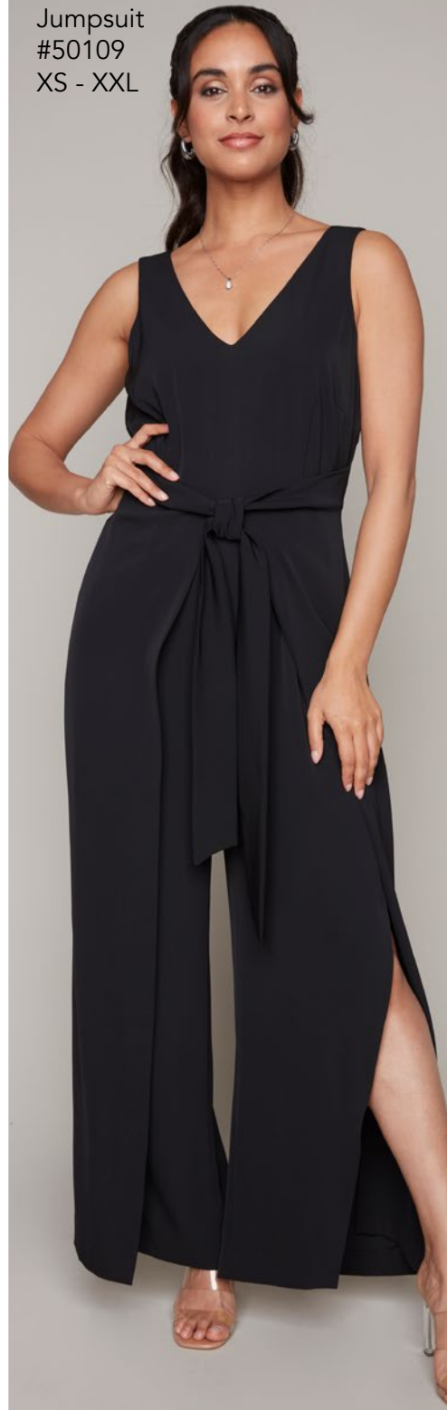
Jumpsuit #50109 XS - XXL