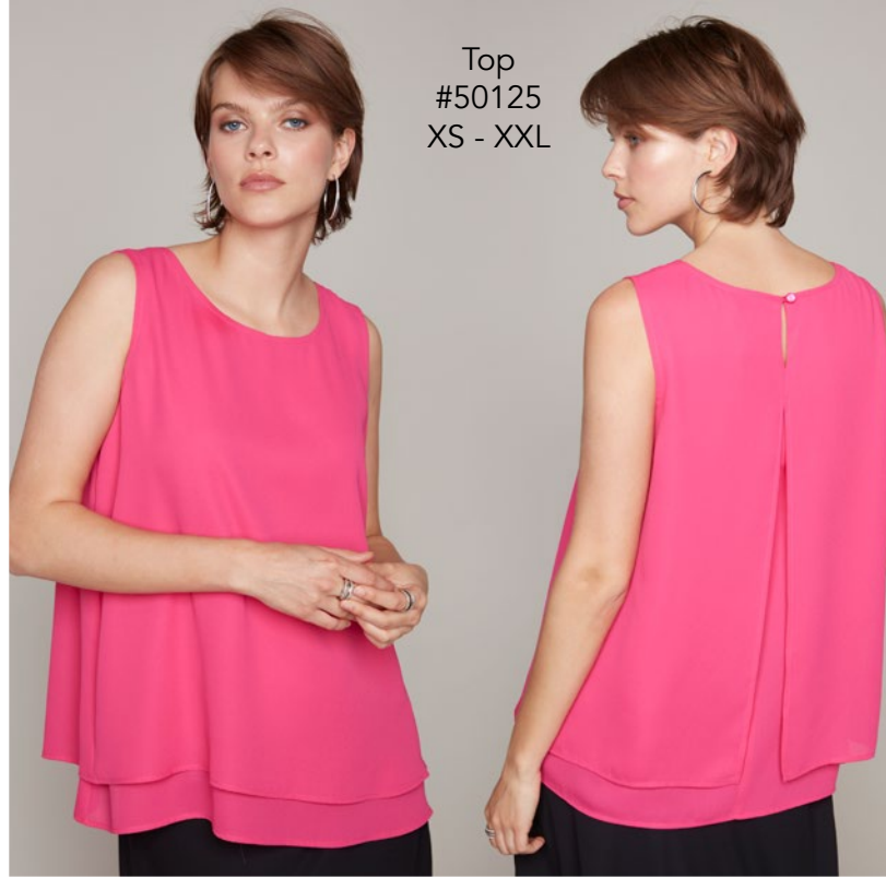
Top #50125 XS - XXL