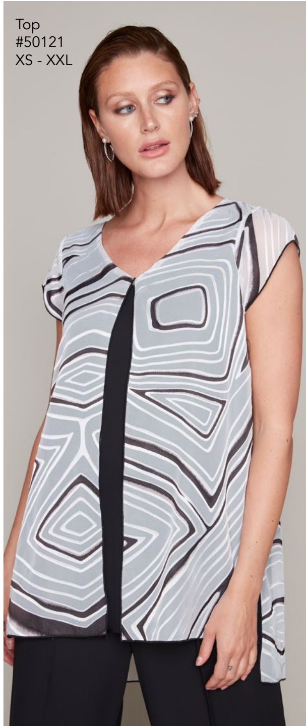
Top #50121 XS - XXL