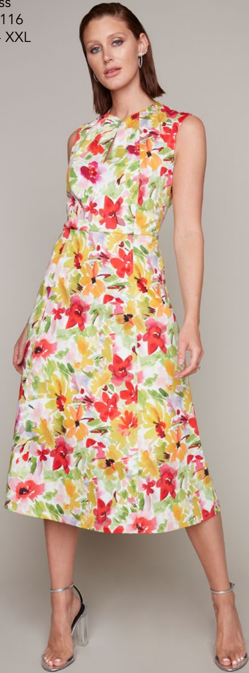
Dress #50116 XS - XXL