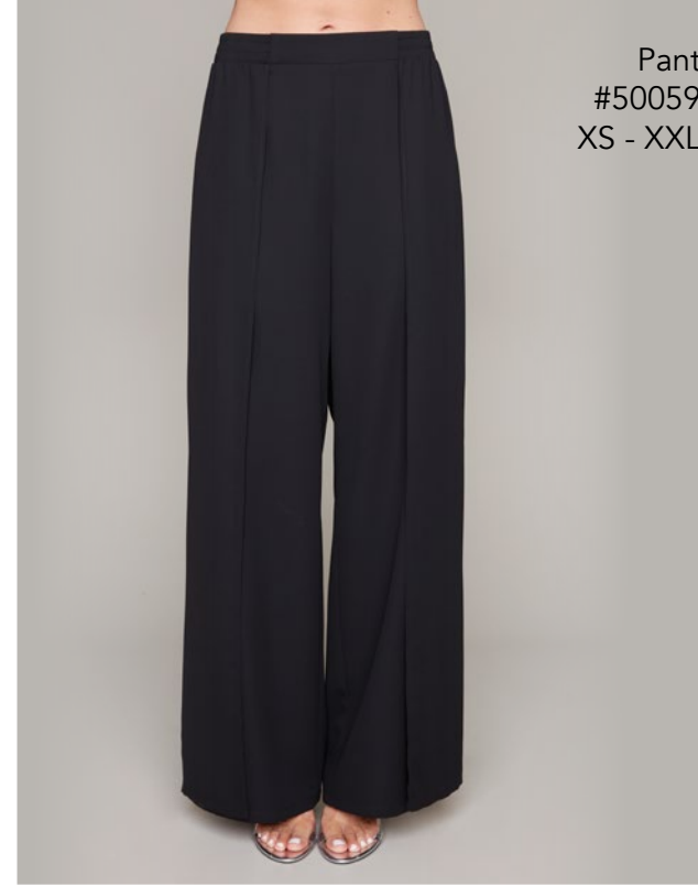
Pant #50059 XS - XXL