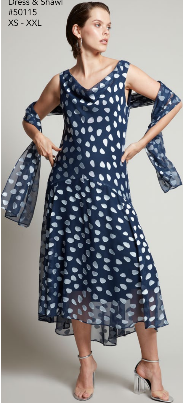
Dress & Shawl #50115 XS - XXL