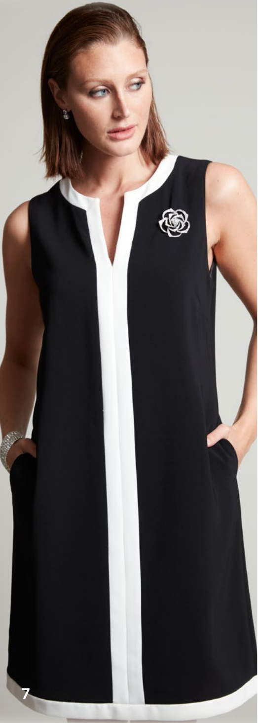
Dress #50108 XS - XXL