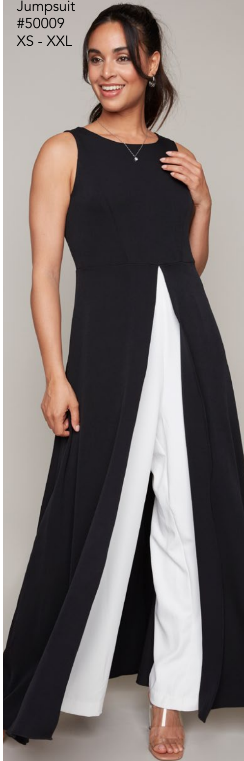
Jumpsuit #50009 XS - XXL