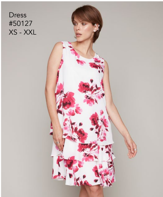
Dress #50127 XS - XXL