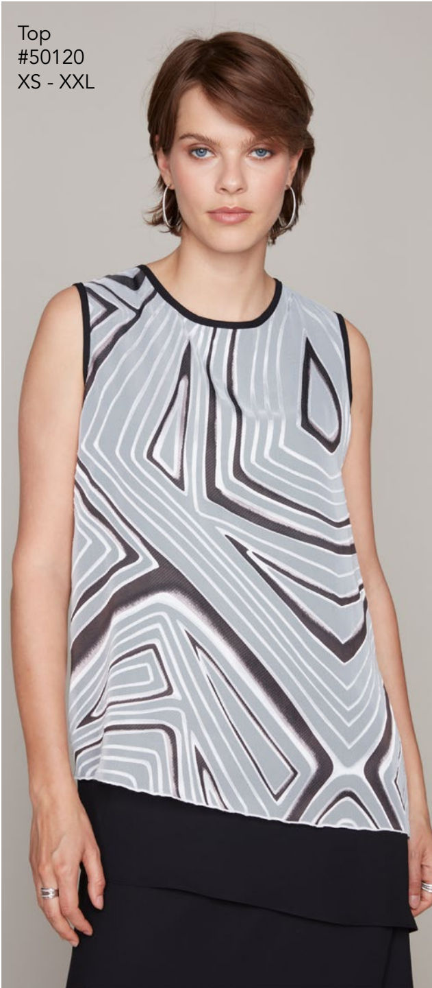
Top #50120 XS - XXL