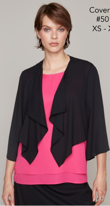
Cover Up #50124 XS - XXL