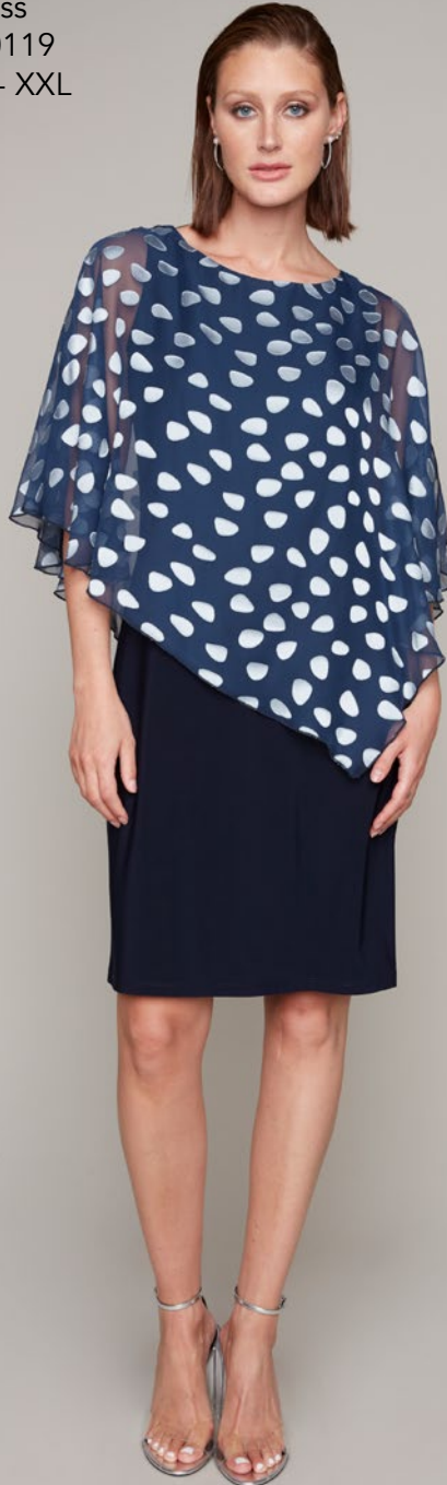
Dress #50119 XS - XXL