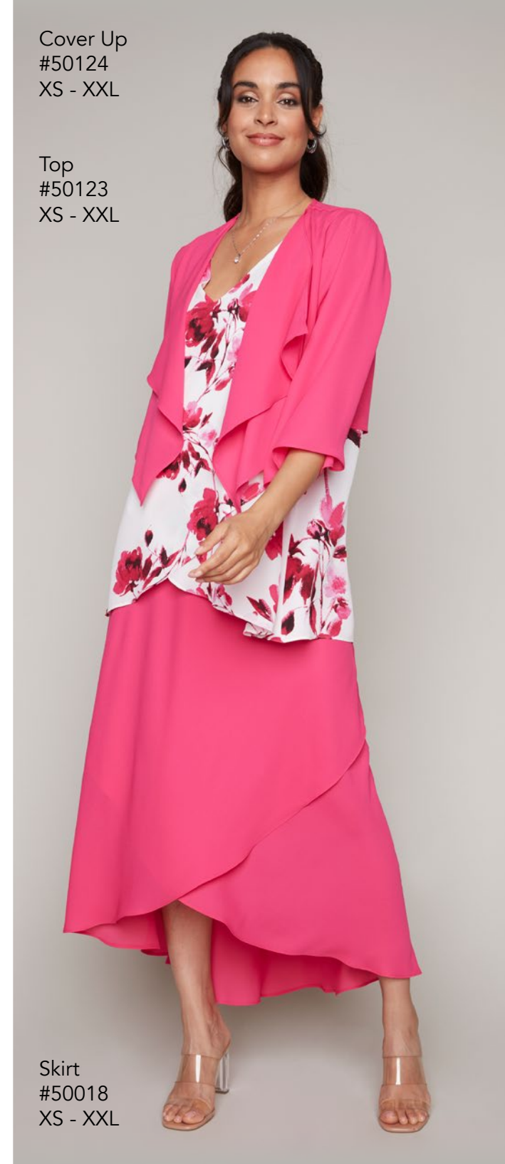
Cover Up #50124 XS - XXL